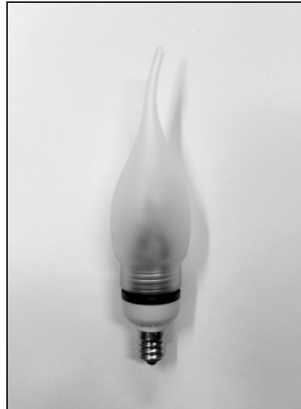
E12 with Flame Tip